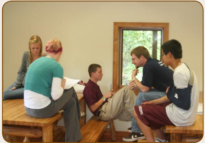
LIFE students divide into teams to focus on one aspect of group planning for the upcoming year of practicing philanthropy.