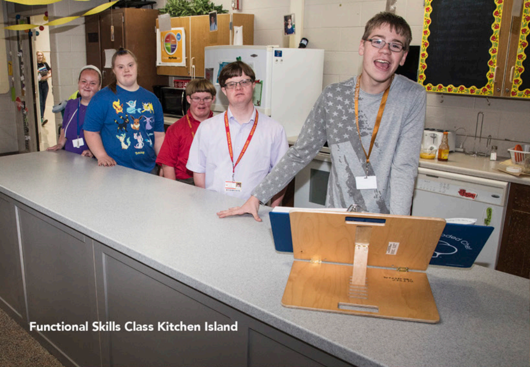
Functional Skills Class Kitchen Island